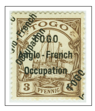
first setting, 3mm. spacing double overprint, one diagonal signed "Bothe" and "Grobe" ex-Marquis de Butte from only known block of four